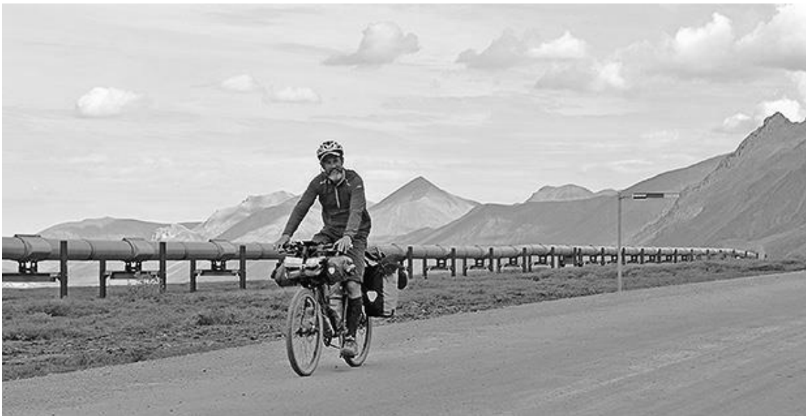
Die hard bicyclists test their skills against the Dalton Highway's steep mountain passes and gravel roads.

When oil first started flowing through the Alaska pipeline, the entire Dalton Highway was off-limits to the public. Anyone wanting to drive down the road had to secure a permit from the industry-owned Alyeska Pipeline Co., which runs TAPS.