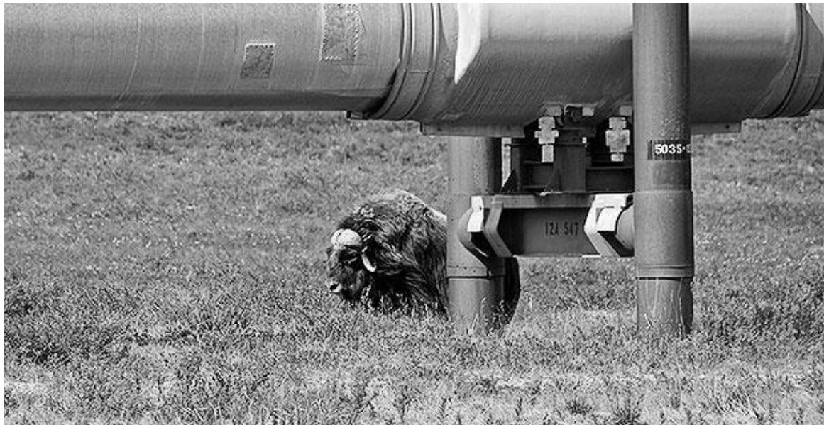
Musk ox lumber along the Alaska pipeline.

The names Deadhorse and Prudhoe Bay are often used interchangeably to refer to the North Slope industrial site that emerged in the years after ARCO and Humble Oil discovered the giant Prudhoe Bay oil field.