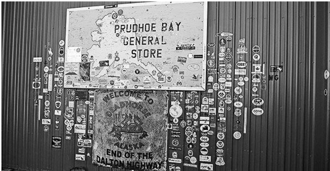
The Prudhoe Bay General Store, the only place in Deadhorse to buy souvenirs and snacks.

Like many tourists driving up the Dalton Highway, our ultimate destination was a speck of civilization called Deadhorse — America's northernmost dead-end destination. From Livengood to Deadhorse, there are no side roads off the highway.