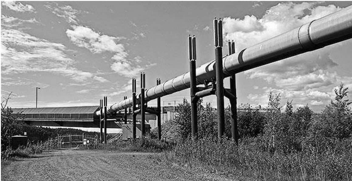
At the Yukon River, the pipeline is attached to the side of the bridge.

After spending our last night on the Dalton Highway at Coldfoot, we stopped across the highway at the federal Arctic Interagency Visitor Center. That site, operated jointly by BLM, the Fish and Wildlife Service and the National Park Service, provides information on off-road trips along the Dalton Highway.