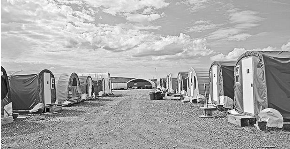
At the Toolik Field Station, the University of Alaska, Fairbanks, provides housing and services for a broad array of scientists.

Before Alyeska began building the Dalton Highway and the TAPS pipeline, the industry-owned company set up a string of work camps along the planned pipeline route to provide housing for thousands of employees. Once the projects were completed, most of the camp sites were abandoned and dismantled.